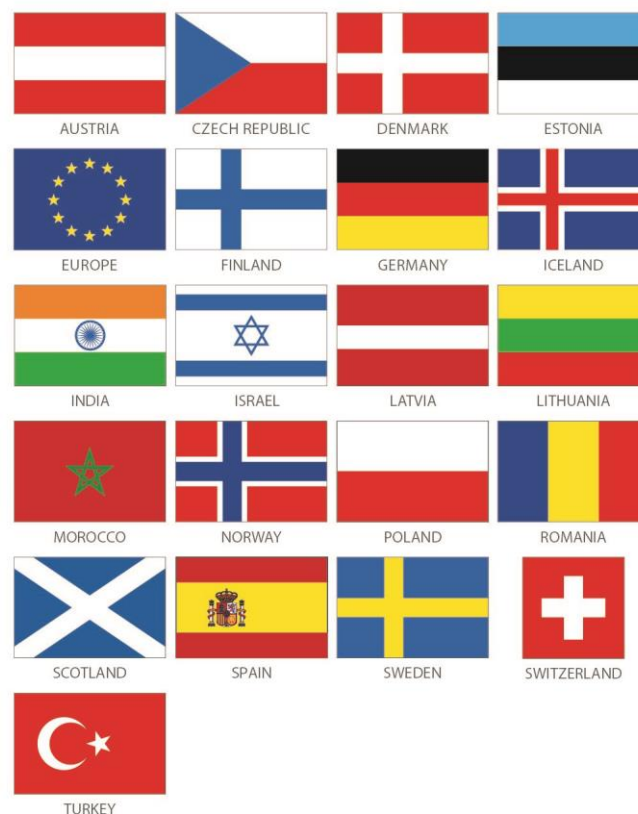
Fig. 1: Joint Call 2020 digital transformation for green energy transition (MICall20) partners

The countries and regions participating in the Joint Call 2020 consists of a subset of national and regional funding partners from the ERA-Net Smart Energy Systems (ERA-Net SES) initiative and external partners connected to the Mission Innovation (MI) initiative. An overview of participating countries and regions is depicted below (Fig. 1).